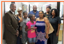
Academic and Behavior School West Holds Open House 2016 p. 5