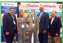
Members of the Executive Leadership Team pose with fictitious EDGAR at TASA/TASB p. 6