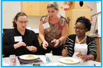
Cracking Up: Plate Tectonics and the Structure of the Earth p. 2