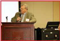
Sen. Bettencourt Attends Summit at HCDE p. 4